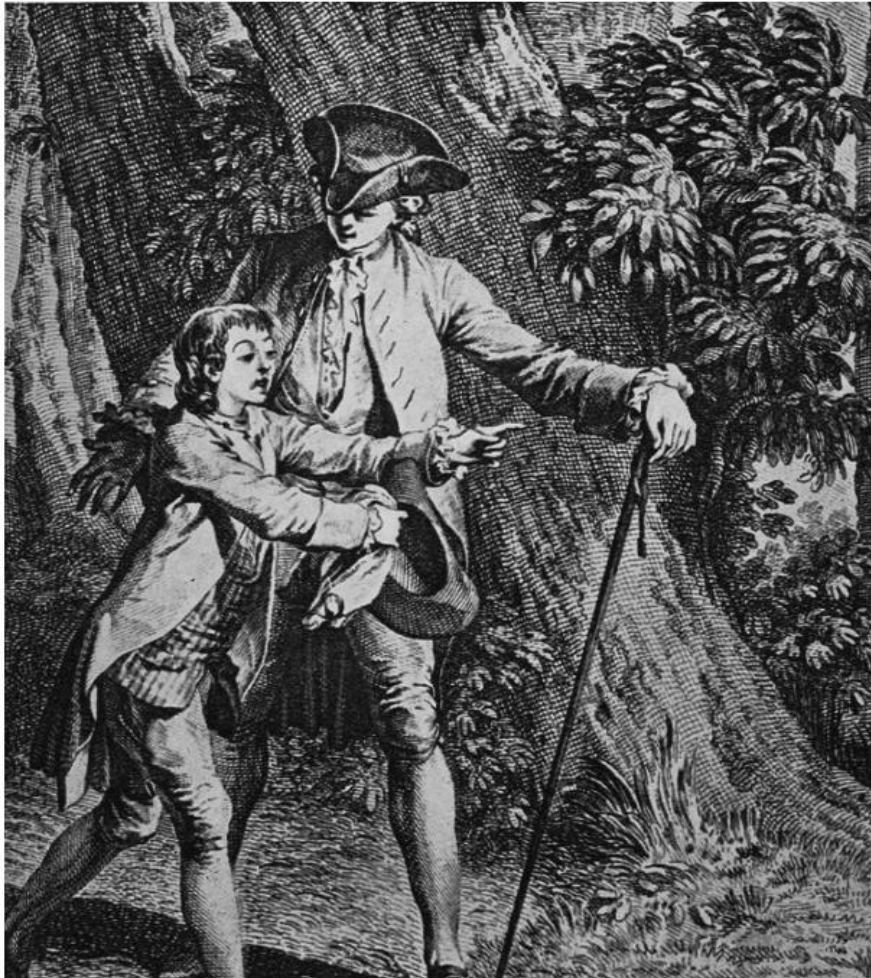
(Cover: J-J Rousseau: Emile ou de l'éducation )

Keep the Language flowing, right into very old age, becoming a valuable citizen scientist as you record Nature in your 'hood.